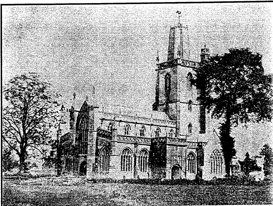
St Mary's Yatton, 1880